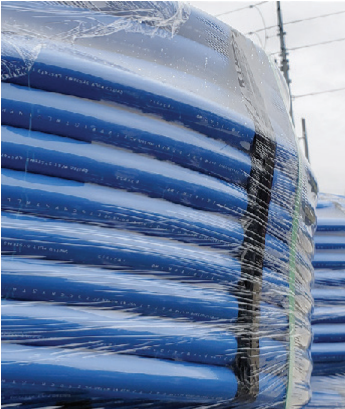
Figure 1. UPS can package Crystal Line HDPE pipe in coils, reels or straight line.